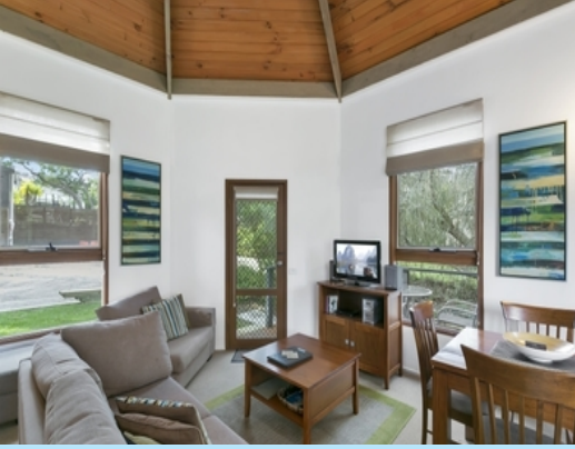
4/2-4 Barton Court AIREYS INLET VIC