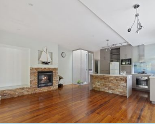
2/6 McLennan Street Apollo Bay, VIC