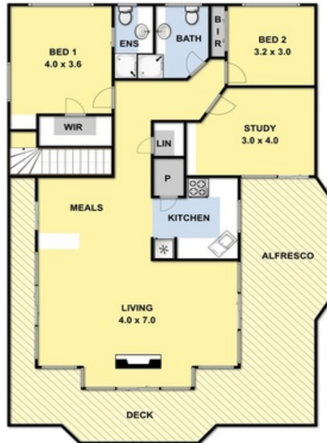
COTTAGE FIRST FLOOR