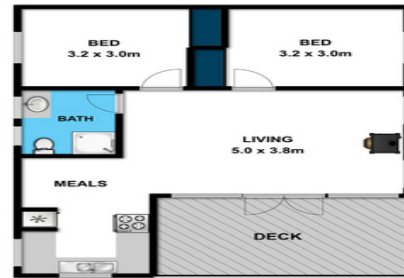
Cottage (not in position)

Whilst bwrn.com.au has made every attempt to ensure the accuracy of the floor plan contained here, measurements are approximate and no responsibility is taken for any error, omission, or mis-statement. This plan is for illustrative purposes only.