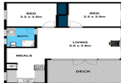
Cottage (not in position)

Whilst bwrn.com.au has made every attempt to ensure the accuracy of the floor plan contained here, measurements are approximate and no responsibility is taken for any error, omission, or mis-statement. This plan is for illustrative purposes only.