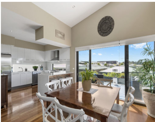
52 Shorebreak Street TORQUAY, VIC