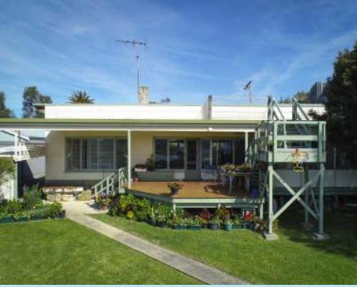
28 Noel Street Apollo Bay, VIC