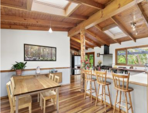
1185 Winchelsea-Deans Marsh Road Winchelsea South, VIC