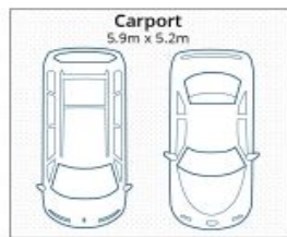
( Not In Position )