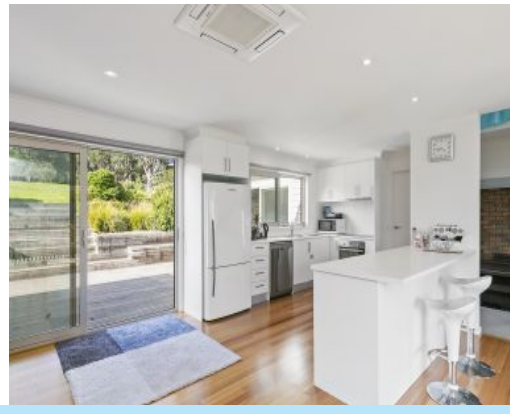
6 Brent Avenue Aireys Inlet, VIC