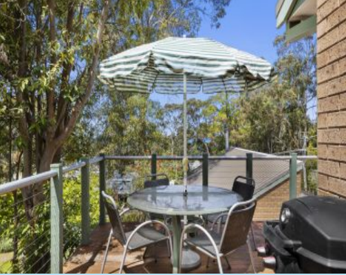
4/11-13 Belvedere Terrace Lorne VIC