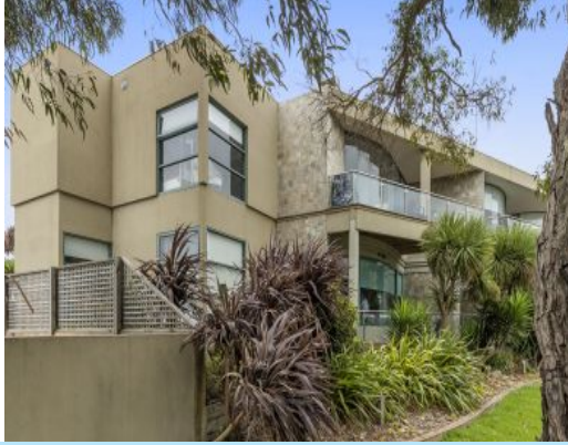
7/105 Great Ocean Road Anglesea, VIC