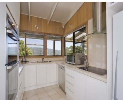
41-43 Beach Road Aireys Inlet, VIC