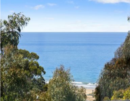
2/8 Hopetoun Terrace Lorne, VIC