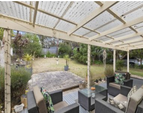
3 Great Ocean Road Aireys Inlet, VIC