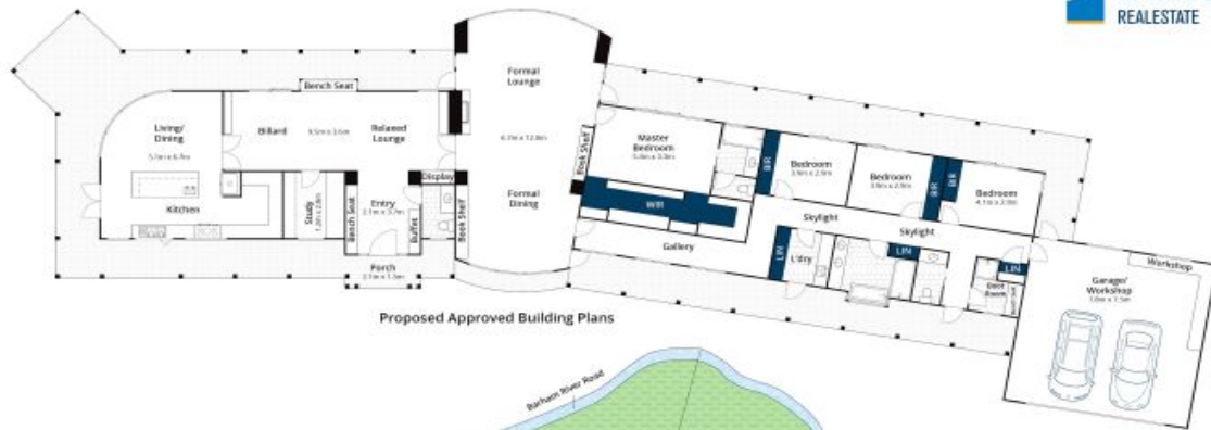
Proposed Approved Building Plans